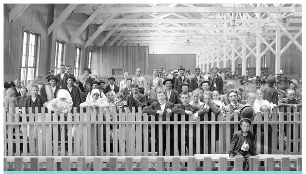
Locust Point has been called "Baltimore's Ellis Island", having been the 3rd largest point of entry for immigrants to the U.S after New York and Philadelphia.

MORA has helped more than 40,000 refugees make Maryland their home, aiding their transition from "displaced persons" to independent, contributing members of the national economy and the local communities. We work through a network of public and private service providers, to plan, administer, and coordinate transitional services aimed at helping refugees become self-sufficient as quickly as possible. Key areas for aiding refugees in adjusting to American life include financial assistance, job placement, community orientation, English language and vocational training, academic support for youth, case management, and other support services.